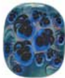
Birger Kaipiainen, Decorative Dish (violet) / 1964 Arabia / Private collection

Ceramic Art in Finland flourished most in 1950–1960 period as the "fine art". In this era, known as the "Golden Age", the expression through Finland's original ceramics, which clearly differentiated from the modern design of Scandinavia, turned out creations one after another. In this exhibition, we will methodically introduce Finnish ceramics in Japan for the first time, focusing on works from artists in affiliation with Arabia, Finland's representative ceramics company.