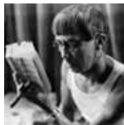
Léonard Tsuguharu Foujita circa 1928

To commemorate the 50 years since the death, we introduce the painter Léonard Tsuguharu Foujita's work on a great number of illustrated books he produced throughout his lifetime. Centering on his "Book Work", including books published in France before the WWII, his work in Japan during the 1930s and 40s, and illustrations of Edition de Luxe after immigrating to France in 1950, we will display paintings and prints, postcards and illustrated letters to friends, handmade toys and pottery, introducing Foujita's wide range of creative activities.