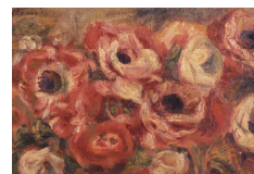
Pierre-Auguste Renoir, Anemones, Maeda Ikutokukai collection