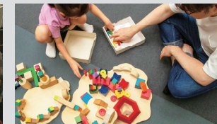
From a 2019 workshop photo: OKAGAWA Sumiko