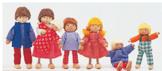
Finger Puppets; Family of Seven, HERWIG (Germany), Atelier Niki Tiki collection

We take a look at dolls and doll-related toys—mainly modern European dolls, with a focus on German and Swiss. We start with cloth dolls that are soft to touch, and eventually come to huggable dolls which were originally made for dollmakers' own children and then spread to the world. Also exhibited are dollhouses, finger puppets, marionettes and more. We introduce dolls as children's friends, with whom children connect play and life, and we can feel the rapport children developed with dolls.