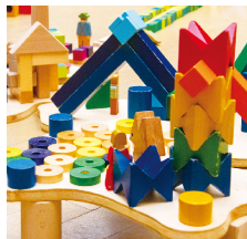
MMAT Toy Collection

MMAT owns the "Toy Collection" that consists mainly of "excellent-design" and "think-with-hands" type of wooden toys collected internationally and domestically. The picture books, "Circle, Triangle, Elephant!" and "Ones and Threes" (written & illustrated by OIKAWA Kenji & TAKEUCHI Mayuko) focus on the fun and pleasure in stacking and laying blocks of various shapes. The books and our "Toy Collection", both of which emphasize the importance of having infants and toddlers to "play" are displayed together.