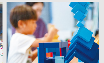
From activities of 2024 photos:Sumiko Okagawa

* For details, please visit our website.