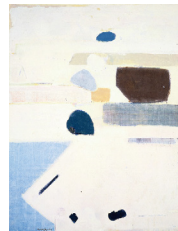
OKADA Kenzo, Between, 1958, oil on canvas, MMAT

OKADA Kenzo is a painter who has lived in the art worlds of two cities, in Paris in the 1920's and in New York after the 1950's. He created his atelier in Jiyugaoka, Meguro City, in 1929. This Exhibition features the period of OKADA when, after his New York years, the artist gradually moved towards "abstract" style and established his own style of combining light-color surfaces. We would like to unravel the process from his two study-abroad experiences.